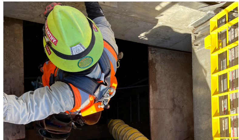
Crews working on the interior of the wet well and valve vault structures, which are part of the storm water pump station.

STAY CONNECTED Construction Hotline 800.679.9570 www.JurupaGradeSeparation.com