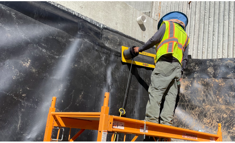
Work continues on the retaining wall support system on Jurupa Road at Van Buren Boulevard.

STAY CONNECTED Construction Hotline 800.679.9570 www.JurupaGradeSeparation.com