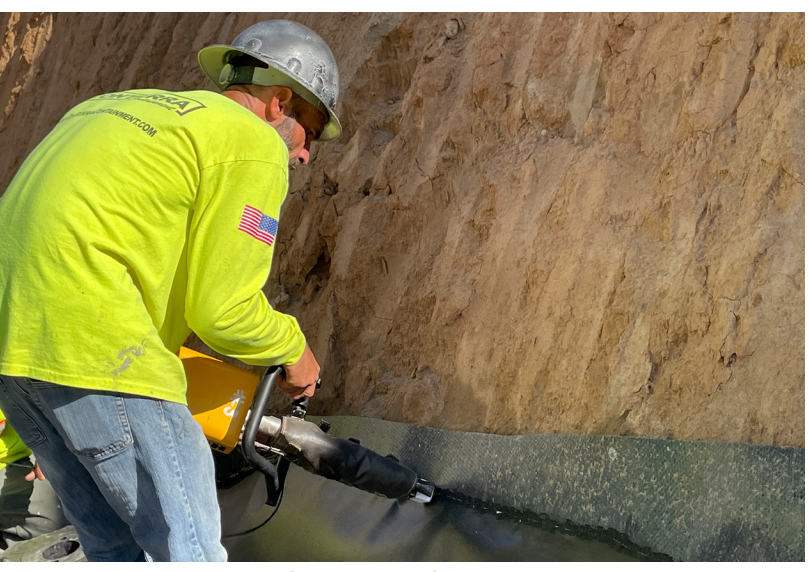
Crews installing waterproofing material for the retaining wall support system.

Please watch for survey crews during daytime work hours in the area of the Jurupa Road and Pedley Road intersection. Nighttime potholing work will begin soon near the intersection in preparation for Pedley and Jurupa roads improvements.