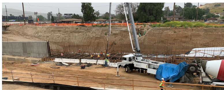
Crews placing concrete at the retaining wall system for the Jurupa Road underpass.